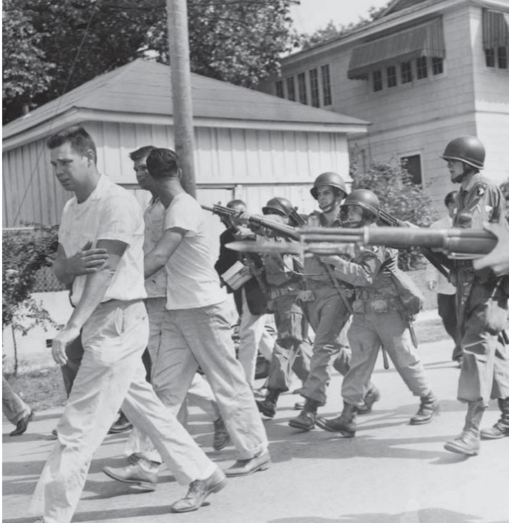
Bayonet Point, September 25, 1957